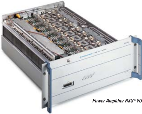
Power Amplifier R&S® VU 825

An innovative amplifier controller is used, which is identical for all sound and TV transmitters of the R&S® Nx 8000 family. This controller not only monitors and evaluates protective functions (e.g. overtemperature switchoff, VSWR reduction, transistor failure detection), but also provides phase correction and control of the RF output power. Output power control prevents, for example, the amplifier from being overdriven in the event a transistor fails, thus ensuring a long life for the individual transistors. Each amplifier module is, therefore, self-monitoring and self-protective.